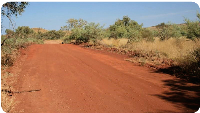
FIREBREAKS Five (5) metres wide clear of flammable material and trafficable.