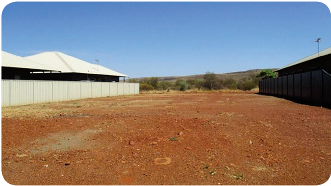
LAND IN TOWNSITES Vacant land