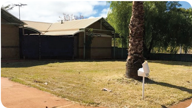
LAND IN TOWNSITES Established lawns and gardens