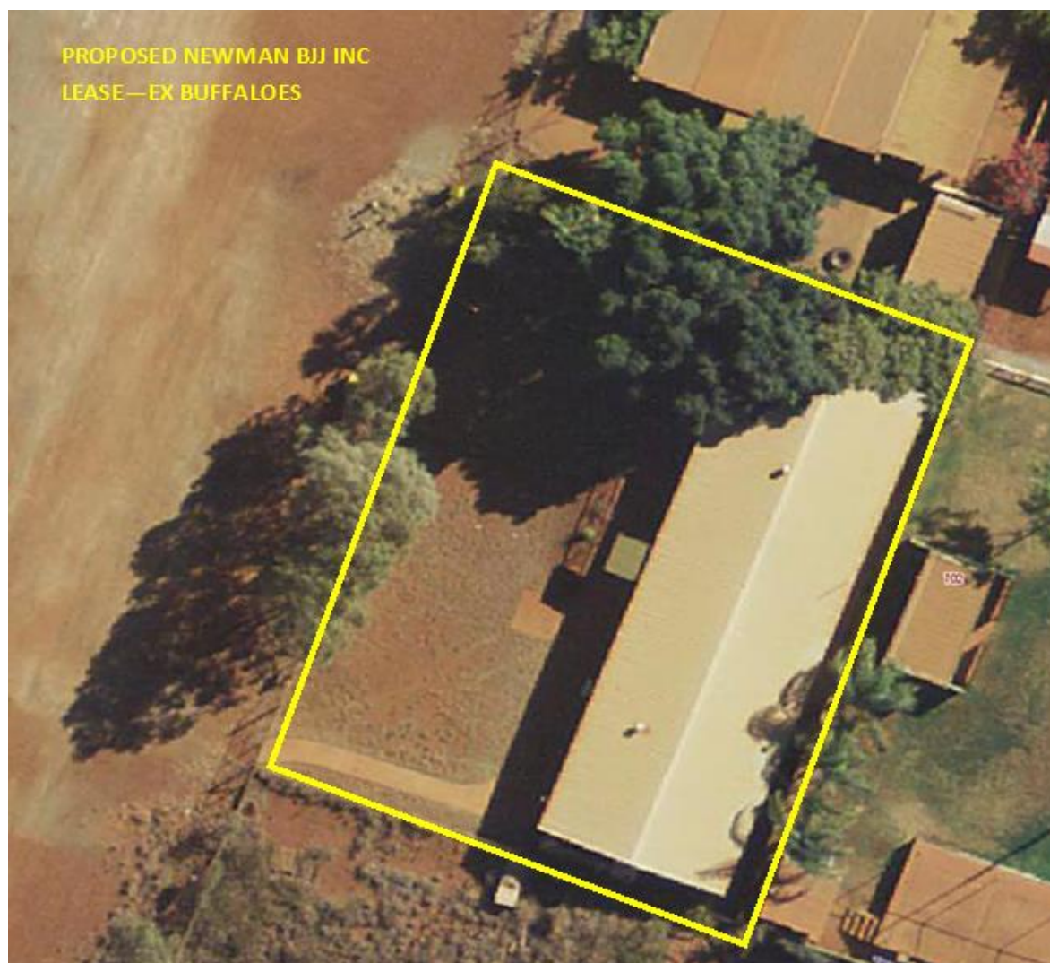
Building Measurements – Allocated areas of use