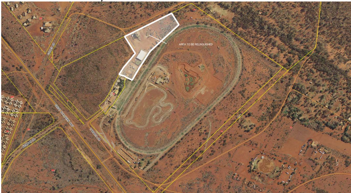
Area of land to be relinquished from Reserve 39519

The area to be excised from Reserve 39519 is identified as Lot 552 on Deposited Plan 407496, which is attached. The two land parcels of Reserve 39519 which will remain managed by the Shire are identified as Lots 550 and 551 on the same deposited plan.