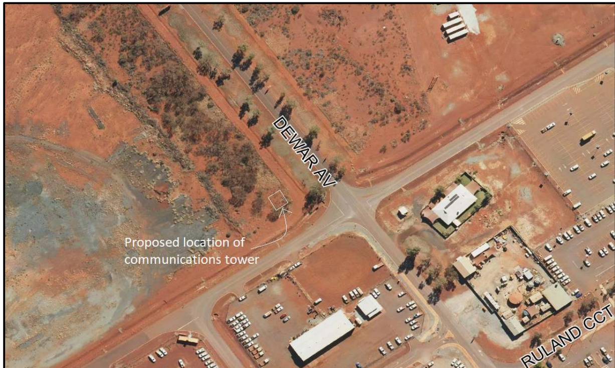
View of the location of the new mobile communications tower

An application has been lodged for a new Telstra tower and is currently being assessed with an expected installation and operation at the end of 2023.