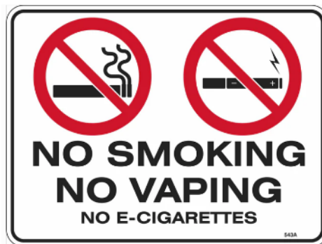
New signage for Airport Vicinity

There is a new sign from the Department of Home Affairs that must be displayed at the Security Screening Area. This sign has also been ordered.