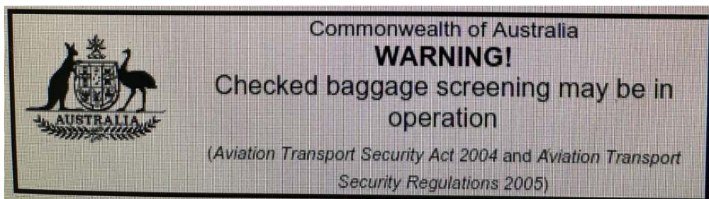
New Sign for Screening Area