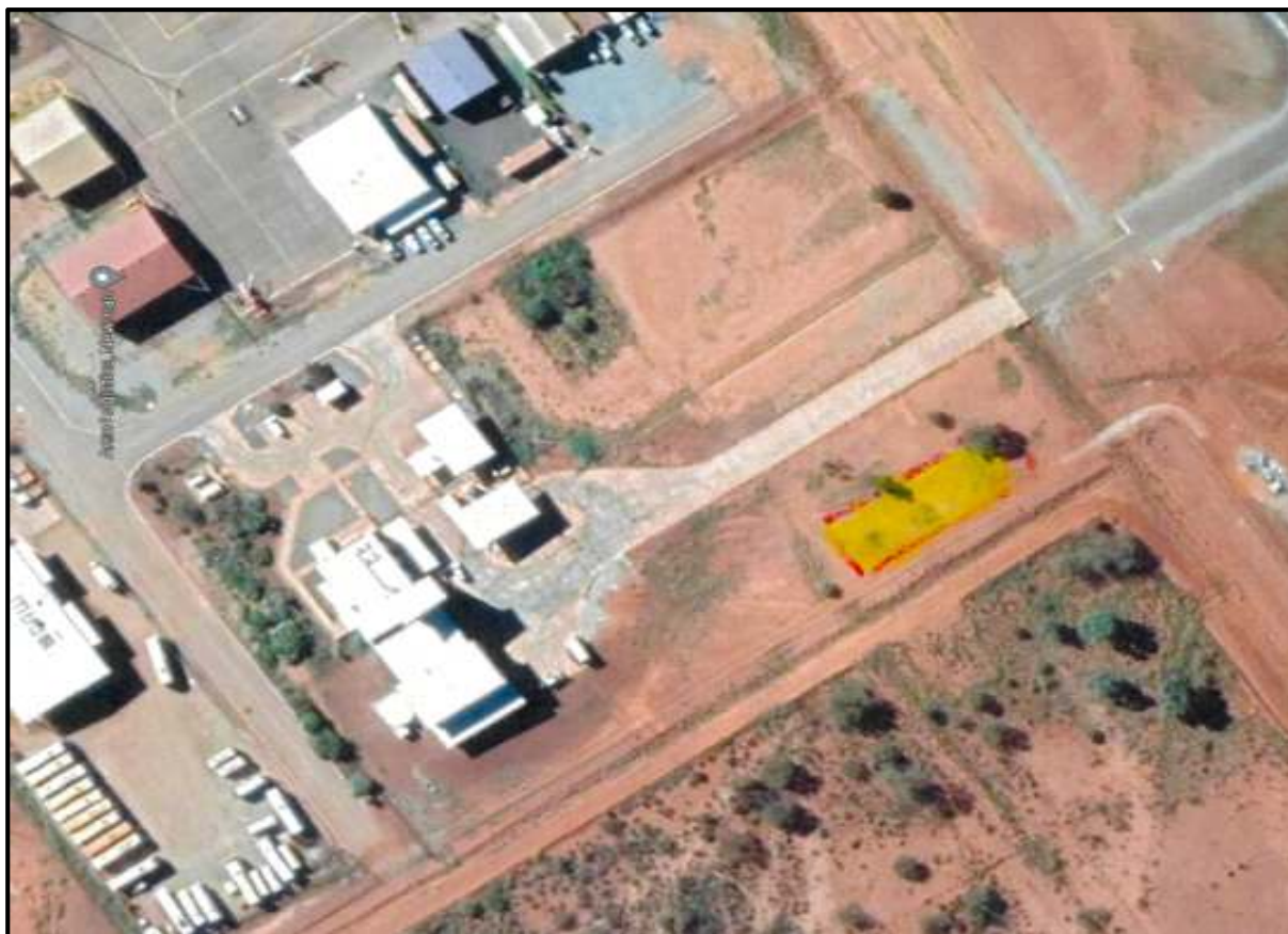
Area for Control Lighting Room – marked as yellow towards the Runway