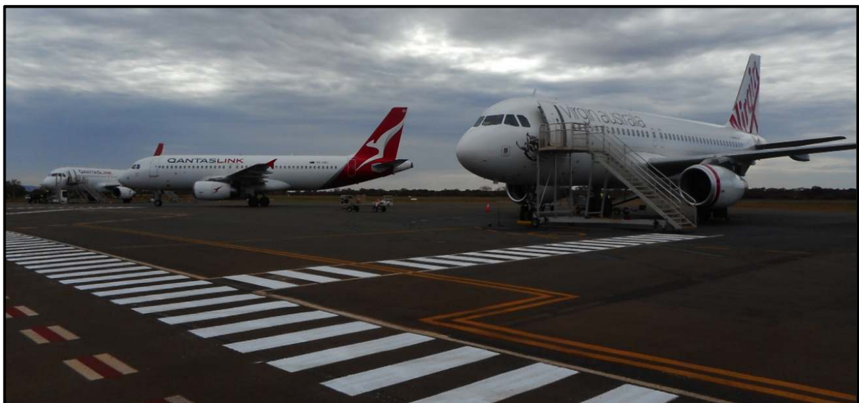
RPT Operation with Qantas Airways and Virgin Australia