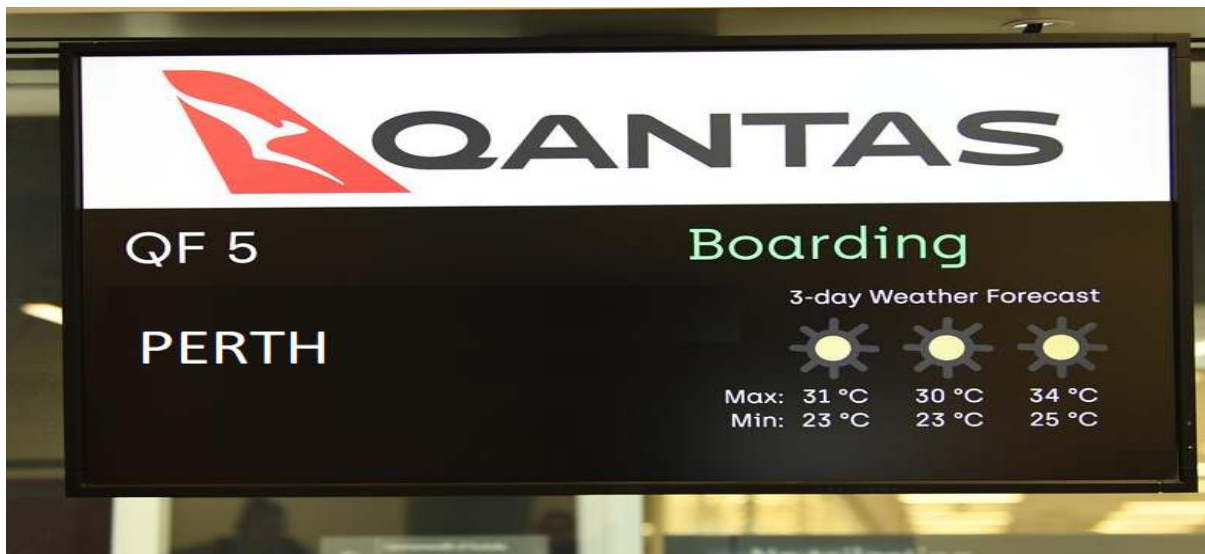
Example of New Flight Display