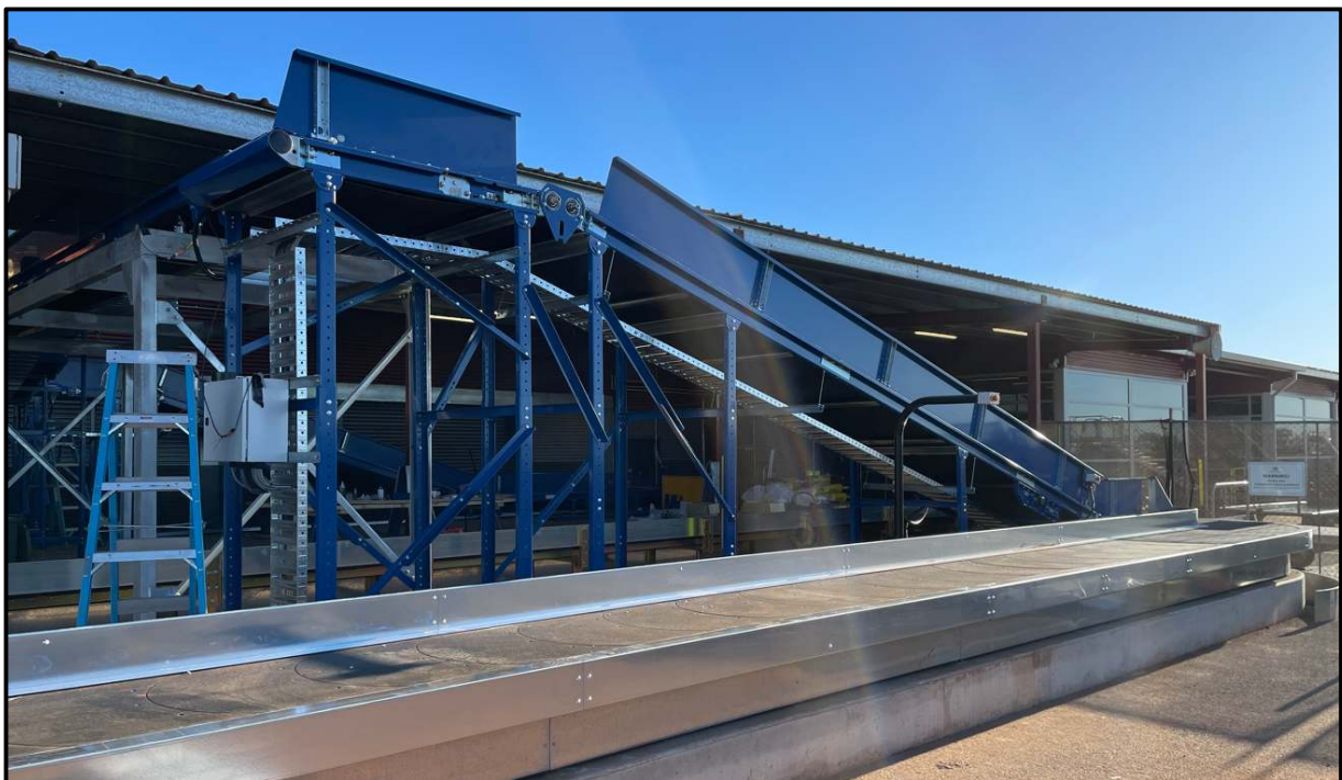
Baggage Carousel Installation Process

The new Baggage Makeup System has now been installed, commissioned and operational. The remaining works for the project is the extension of the roof. Once these works are completed there will be 360 degree access of the new belt system for the ground handlers making it easier for their ramp operation.