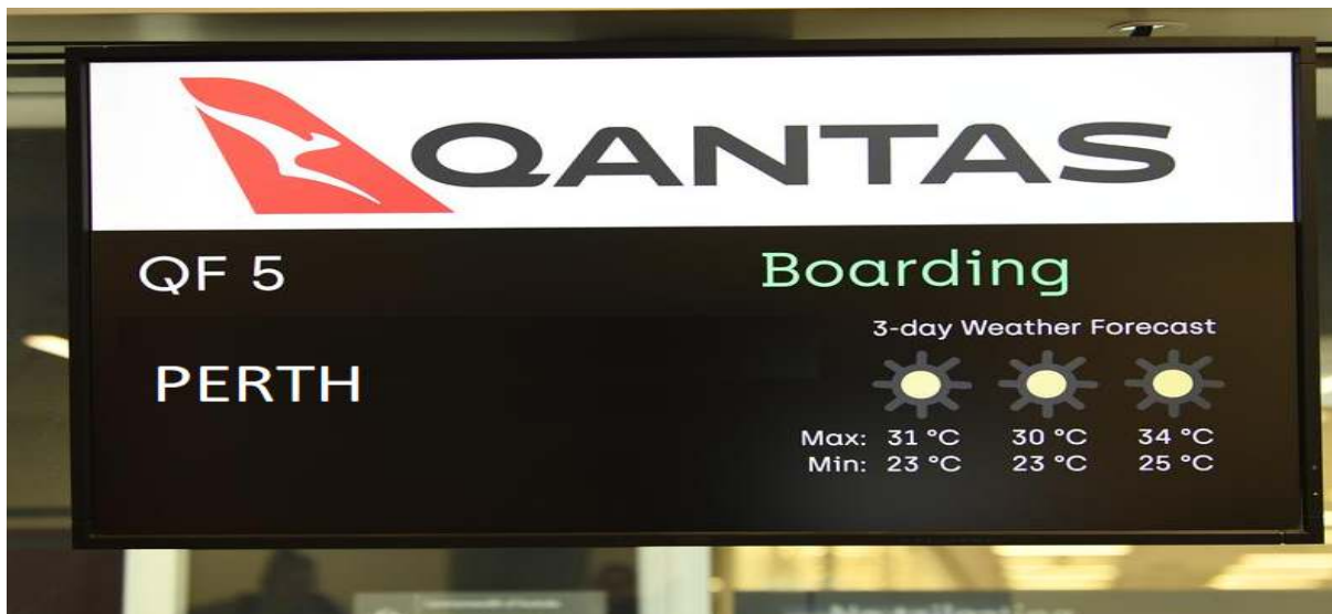
Example of New Flight Display