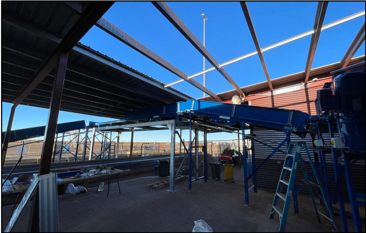
Baggage Carousel – removal of the existing roof to heighten and extend towards the Apron

The Baggage Carousel is currently going through commissioning and testing. The new roof covering and extension has commenced and expected to be completed within the next two months.