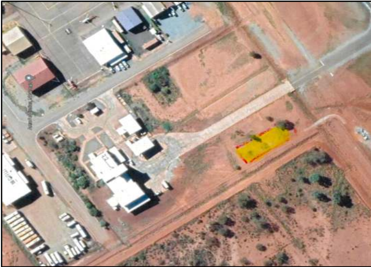
Area for Control Lighting Room – marked as yellow towards the Runway