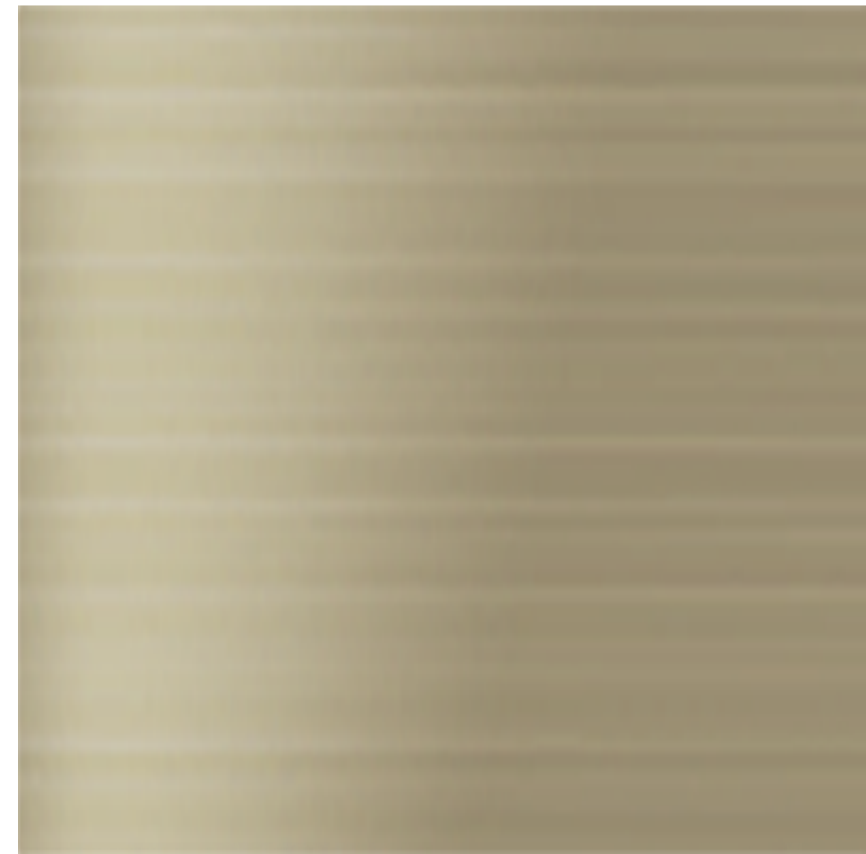
FINISH: BISTRE SUPPLIER: ANODISERS WA