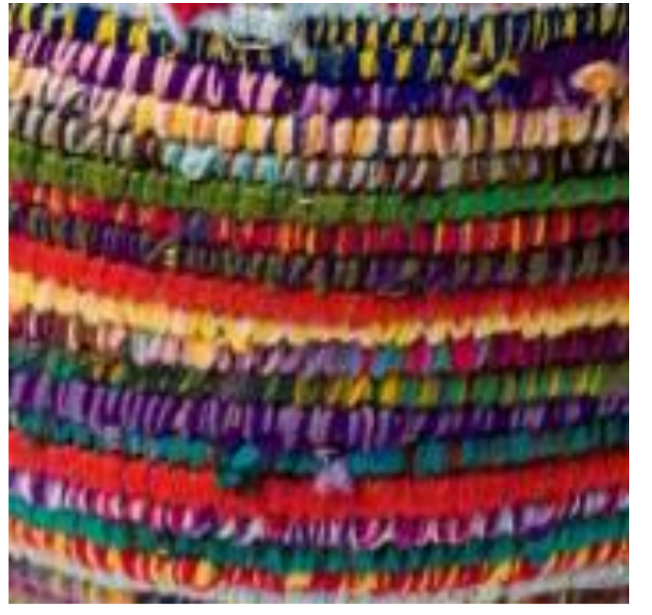
COLUMN GUARD FINISH: SPINIFEX AND COTTON OR SIMILIAR WATERPROOF MATERIAL OUTERLAY SUPPLIER: MARTU ARTISTS

FINAL COLOURS AND WEAVING PATTERN TO BE COMPLETED ON SITE IN COLLABORATION WITH MARTU ARTISTS AND COMMUNITY MEMBERS