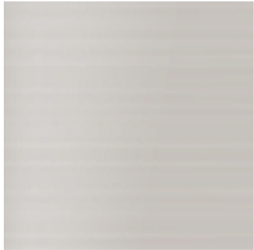
FINISH: CARRARA SUPPLIER: ANODISERS WA

FINAL COLOURS AND WEAVING PATTERN TO BE COMPLETED ON SITE IN COLLABORATION WITH MARTU ARTISTS AND COMMUNITY MEMBERS