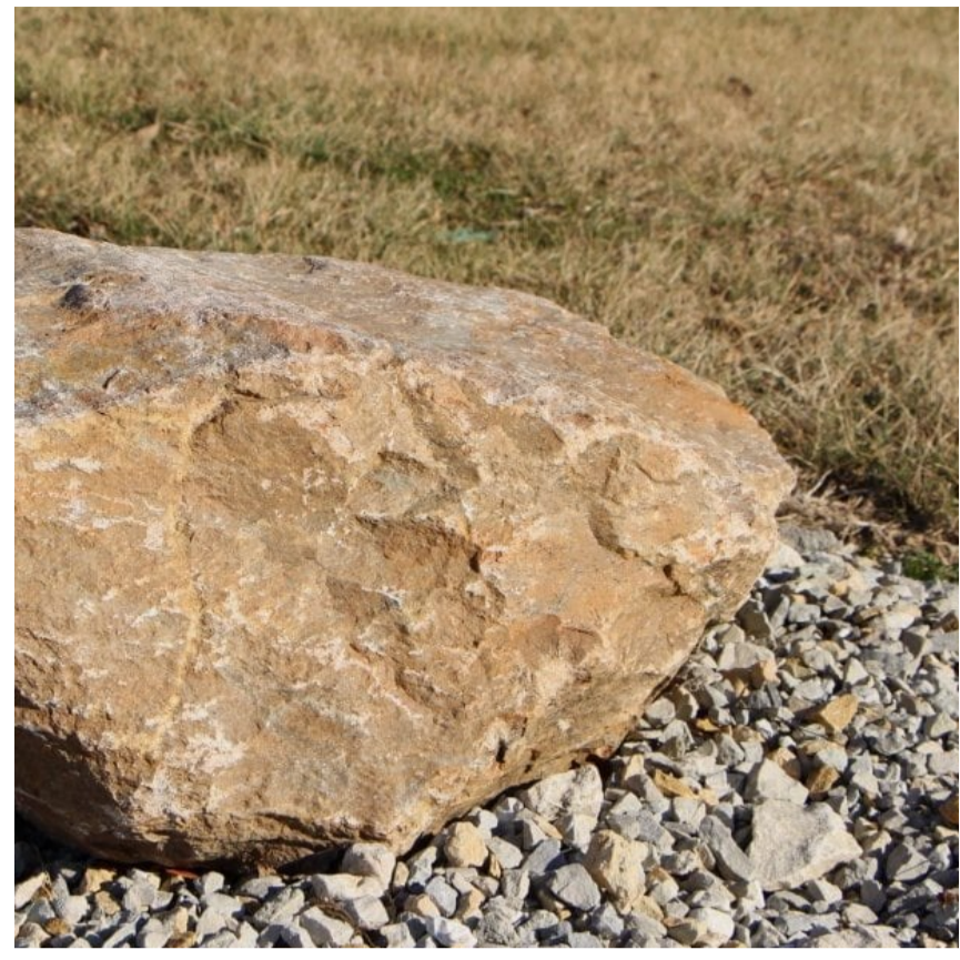
LOCALLY SOURCED BOULDERS FOR SEATING 450MM HIGH WITH FLAT TOP