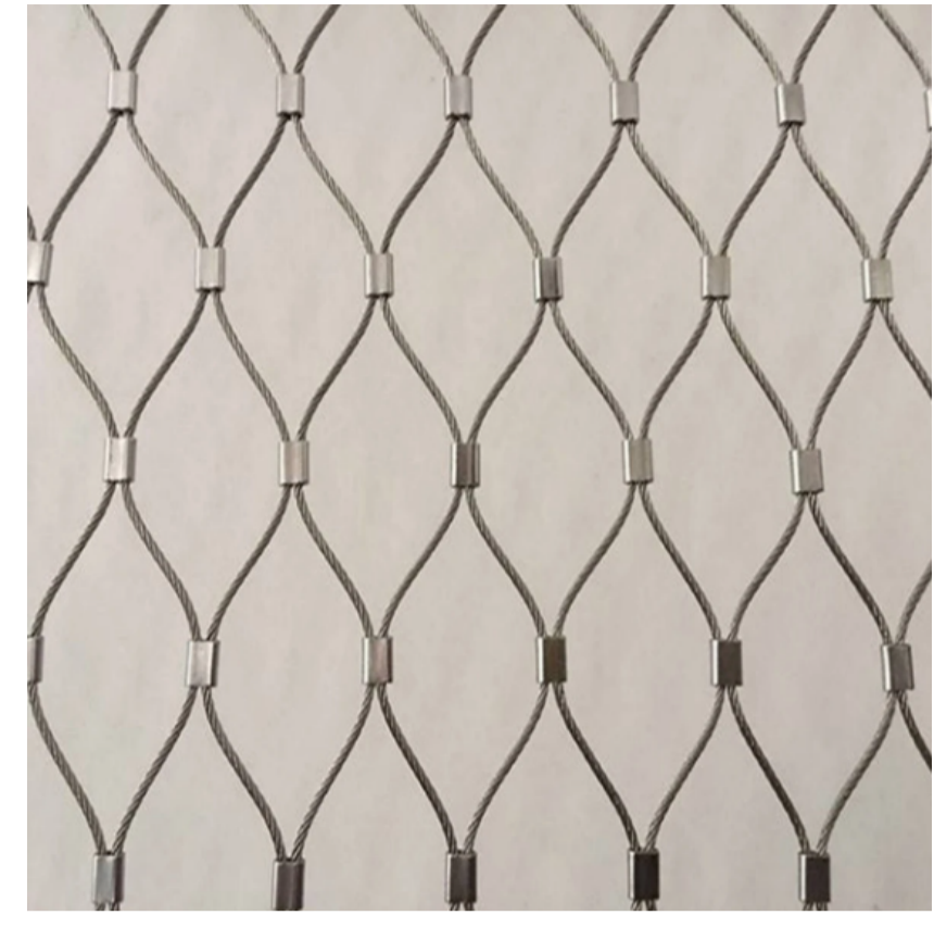
2MM WIDE STAINLESS STEEL CABLE MESH 100MM DIAMOND PATTERN PROVIDE SS FERRULES TO JOIN LENGTHS TOGETHER (SIDE BY SIDE) ALL WIRE MESH TO BE FIXED TO BOTTOM, SIDES AND TOP OF FRAME