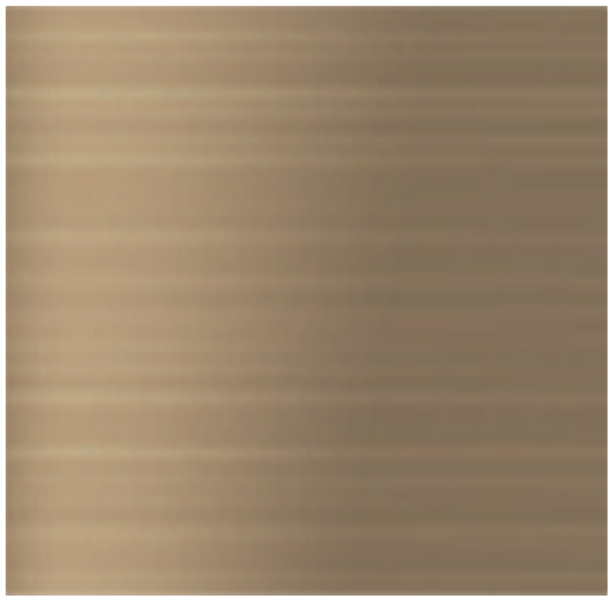
FINISH: MASSIMO SUPPLIER: ANODISERS WA

NOTE: ALL FIXINGS TO MATCH COLOUR OF FINISH OF PERFORATED SHEET