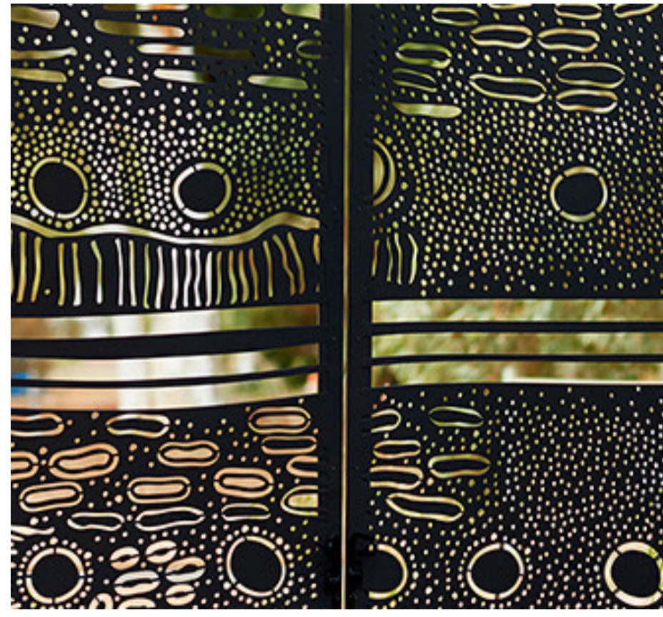
PERFORATED SHADE FINISH: ANODISED (FINISH SELCTIONS INDICATED BELOW) SUPPLIER: PERFMET, LOCKER GROUP OR SIMILIAR FOR THE PERFORATED SHEET ANODISERS WA FOR THE FINISH OF THE SHEET ARTWORK: MARTU ARTISTS

EXTENT OF PERFORATION DESIGN TO BE CONFIRMED IN COLLABORATION WITH MARTU ARTISTS AND PROVIDED FOR SIGNOFF TO SHIRE OF EAST PILBARA